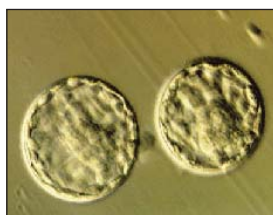
Day 5: Approximately 120 hours post-insemination, expanded blastocyst stage embryos

NOTE: This manual includes andrology, embryology and general knowledge for HCLDs, ELDs and MTs.